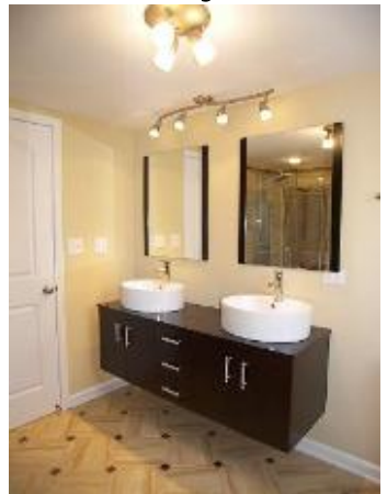
MLS#: 07782278 Detached Single 3616 N Luna AVE Chicago IL 60641