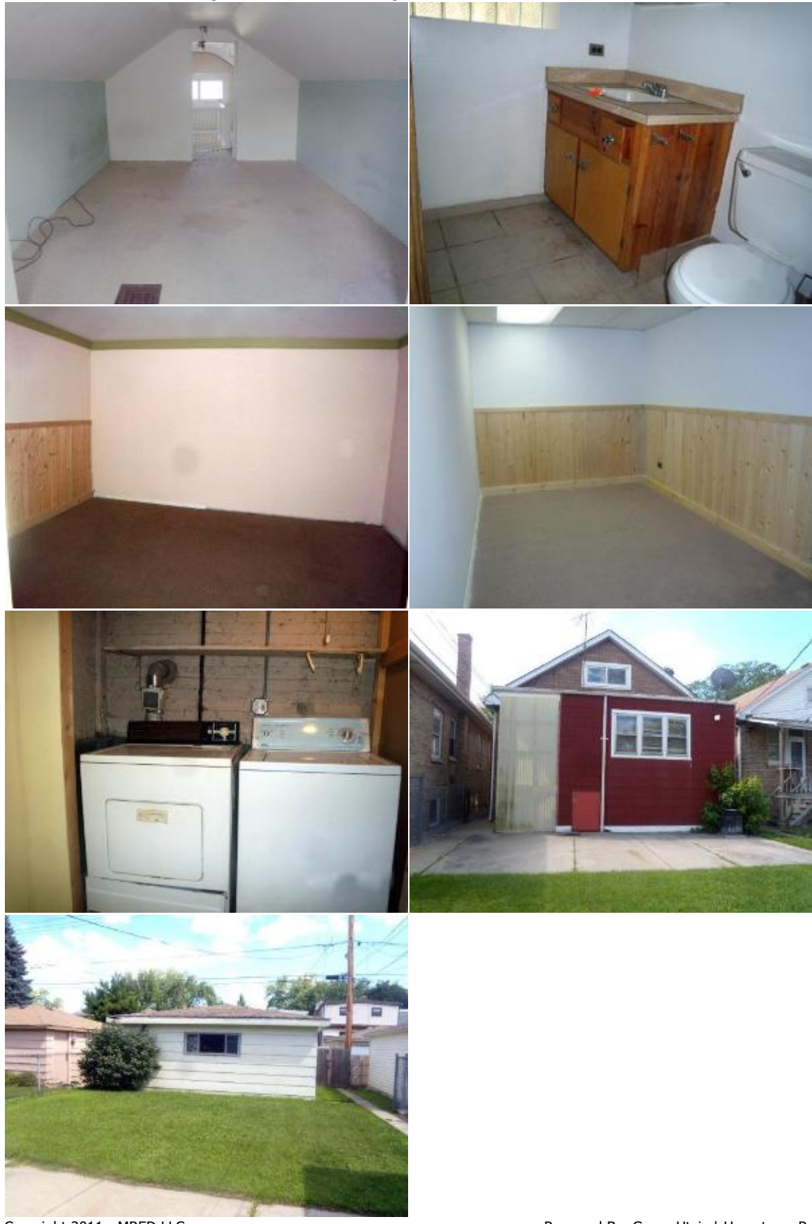
MLS#: 07689585 Detached Single 5814 W School ST Chicago IL 60634